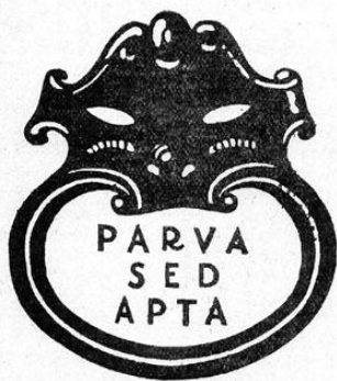
Parva Sed Apta Small but Capable