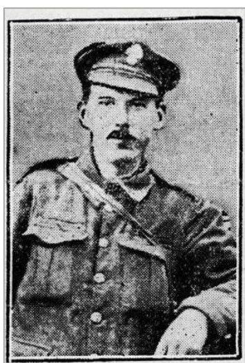
Aberdare Boy Wins the M.M.

Even Lloyd George wrote to his father saying "I cannot tell you how deeply grieved I am to hear of the death of your gallant boy".