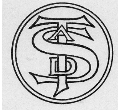
Trecynon Amateur Dramatic Society