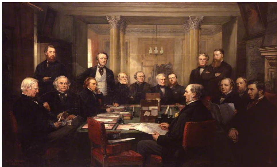
Henry Austin Bruce (seated 5 th from left) in cabinet. Gladstone sits in the foreground.

In 1881 he became Governor of the Royal Niger Company and took a close interest in West African affairs. When the company was, in due course, taken over by the government, Lord Salisbury paid a handsome tribute to Bruce's capacity in conducting its responsibilities and in preserving Britain's influence in the vast areas under its control. Bruce's main interest in his later years, however, was the advancement of education, especially in Wales. In 1880 Gladstone set up a Departmental Committee to examine intermediate and higher education in Wales and Monmouthshire. Bruce, who had suggested the enquiry, was appointed chairman and acted with speed and efficiency. Within a year (August 1881) the Committee's report was published. Hailed as 'the educational charter of modern Wales', it was a radical document proposing the creation of a new system of intermediate schools in Wales and the setting up of two new colleges of higher education, one in north Wales and one in the south.